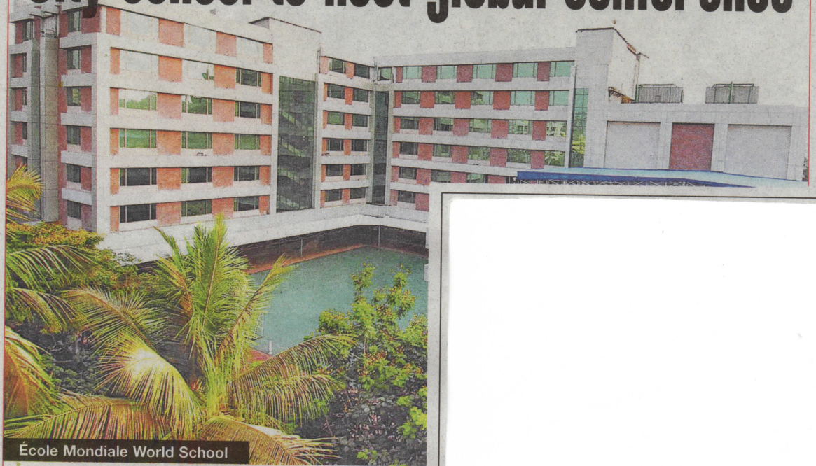
École Mondiale World School

J udged as the second best international day school in India for the second consecutive time, École Mondiale World School is now set to be the venue for a global conference. The school will host the 7th biennial world conference of The Alliance for International Education (AIE) from October 10 to 12. Taking place for the first time in the Asia Pacific region, the conference titled 'Intercultural understanding: reflection, responsibility and action' will intro-